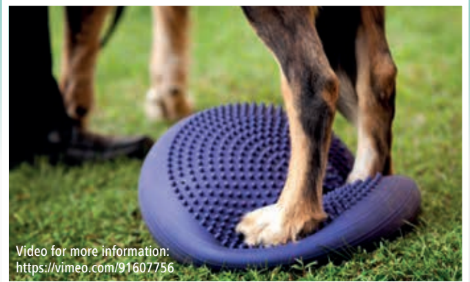
Video for more information: https://vimeo.com/91607756

Do you want to specialize in rehab and physical therapy and get your training from the worlds' leading specialists? Get started any time with your e-learning part and join us for the presence days to focus on labs and interactive case work ups.