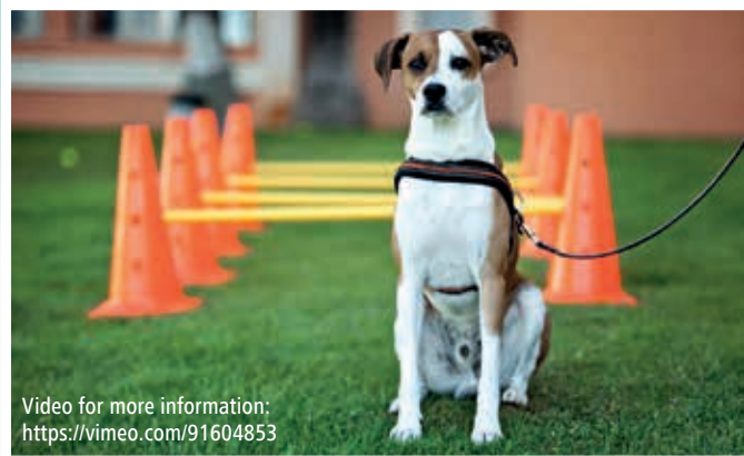
Video for more information: https://vimeo.com/91604853